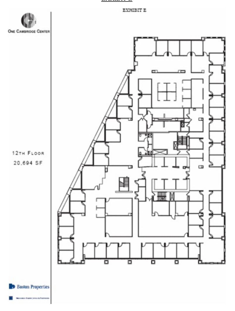
Exhibit E Page 1 of 1