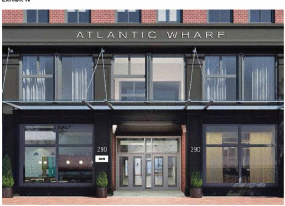
Page 1 Exhibit N